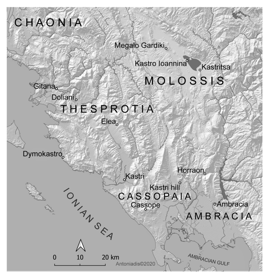
Map 1. Main Regions and Urban Centres in Central and Southern Epirus in 168 BC. Vyron Antoniadis, QGIS, Basemap ASTER.